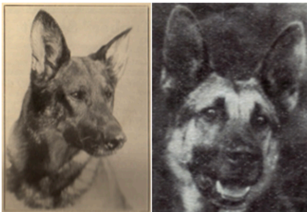
Rin Tin Tin the 1st

During World War I, German Shepherds served heroically as messengers, ammunition carriers, and guides for wounded soldiers. However, anti-German sentiment after the war led to the breed's rebranding in the United Kingdom. To avoid associations with Germany, the name "Alsatian" was adopted, inspired by the Alsace-Lorraine region bordering France and Germany. This name allowed the breed to thrive without