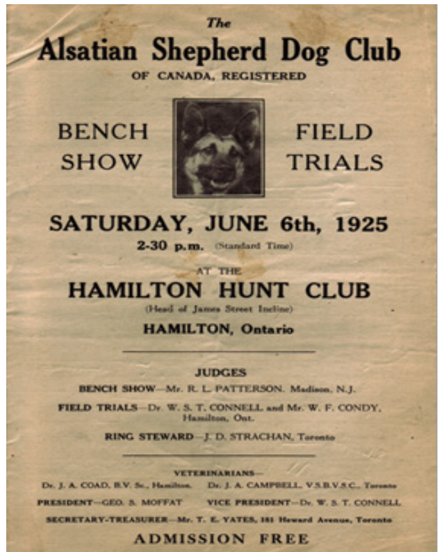
Flyer using the Strongheart logo, 1925