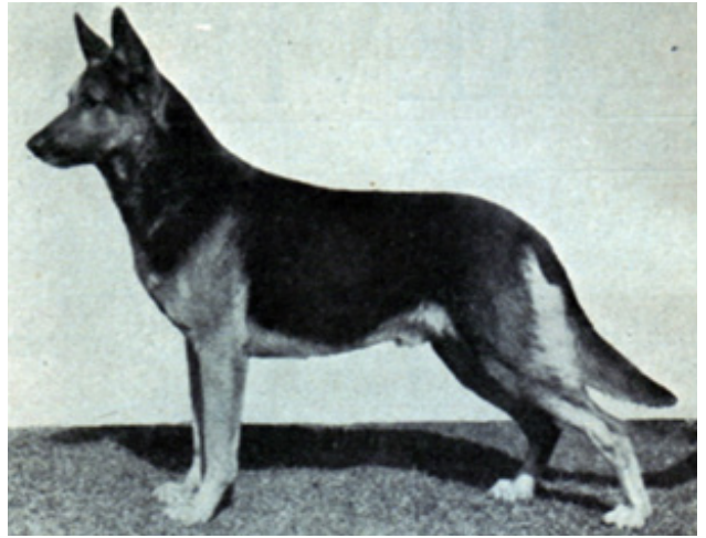
Best of Breed at Royal Winter Fair, 1925

The German Shepherd Dog (GSD) is one of the most iconic and versatile breeds in the world. Known for their intelligence, loyalty, and courage, these dogs have a storied history. Explore the early days of the Alsatian Shepherd Dog Club of Canada, the origins of the GSD, and the story behind the breed's alternate name: the Alsatian.