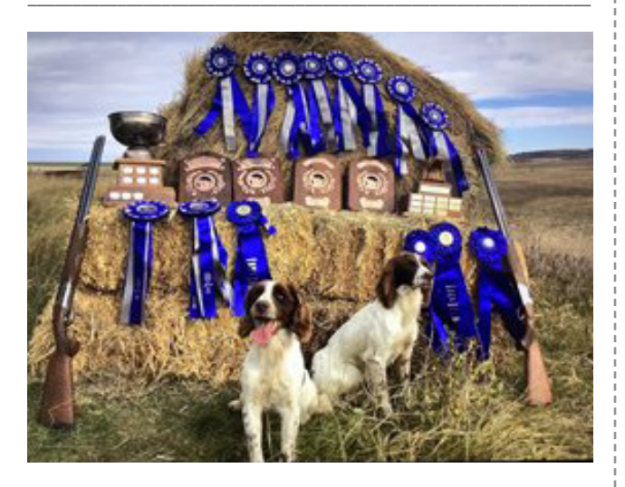
#1 Open All-Age Field Spaniel – NOSC AFTCH FTCH Bushbuster's Colt Forty Five MH

Hunting Spaniels are skilled at locating, flushing, and retrieving fowl on both land and water. The Canadian Kennel Club's Top Field Spaniels of 2022 list includes events from October 2021 to the end of 2022, including National results. Starting in 2023, the results will be tabulated by calendar year, as are all our other events.